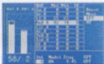
EPT Electro-Puncture Therapy