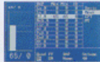
Meas. CMP (Central Measurement Point) Measurement