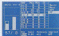
MT Medicament Test