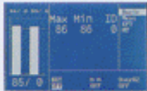
Basic BAZ Measurement

1) High performance with versatile functions